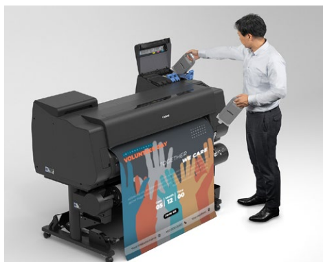
The imagePROGRAF GP-4600S shown with optional multifunction roll unit.